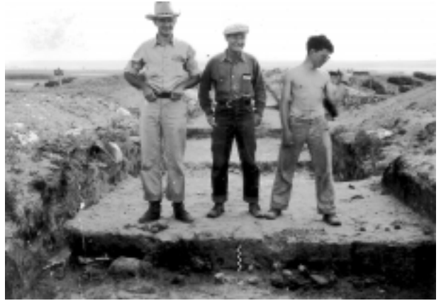
Archeologists on top of Barn Butte, Garden County, 1933.

and Garden Counties to Barn Butte, southeast of Oshkosh. Renaud identified more than forty sites including stream valley locations, rock shelters, and butte-top sites.