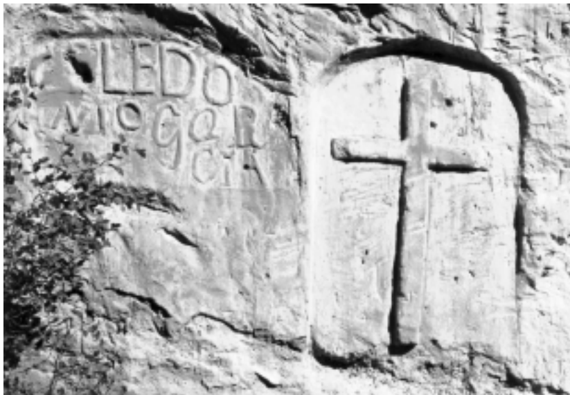
The Spanish Cross, Sheridan County, 1972.

increased greatly and reached its peak from 1876–78. Many of the trail ruts still exist in areas that have not been farmed or developed. Several stage stations existed along the trail. Many of these have been identified as archeological sites during times of the year when vegetation is sparse along the entire length of the trail.