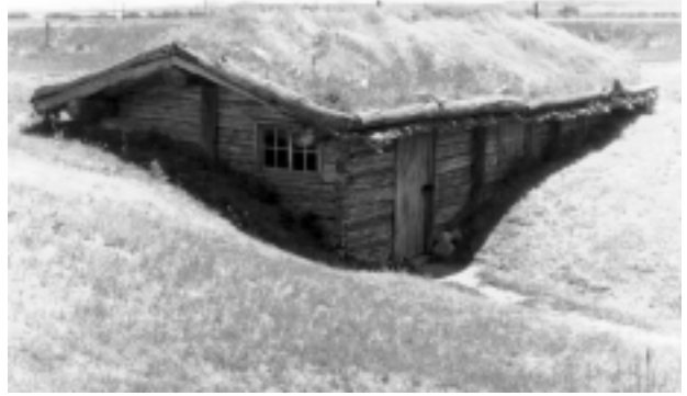
Reconstructed Bordeaux Trading Post, Dawes County, 1973.