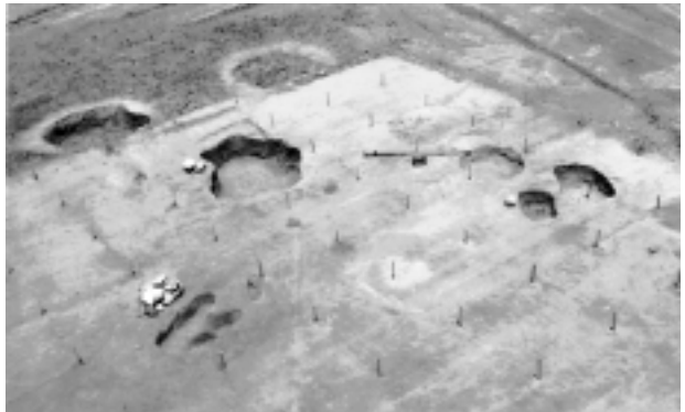
Trading post excavation, Deuel County, 1968.

The Sidney-Black Hills Trail was a 267-mile-long thoroughfare for bull wagons, mule trains, mail couriers, and stagecoaches during the Black Hills “gold rush” of the late 1870s through the early 1880s. The volume of traffic over the trail