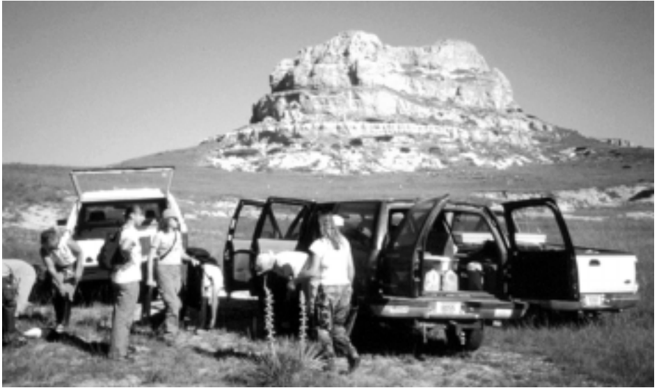
Archeological crew at Wind Springs Ranch, Sioux County, 1999.

and temporally, and span the Paleoindian period through protohistoric Native American occupation as well as including Euroamerican ranch features and historic wagon roads. The locality seems to have been most intensively occupied during the Middle and Late Archaic periods. Testing at several locations on the ranch has revealed intact cultural deposits on butte tops as well as within the stream valley.