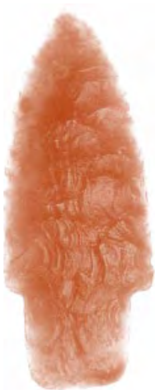
This Alberta point is approximately 9,500 years old.

Investigations at Hudson-Meng were conducted during the 1970s by Chadron State College. The site was initially interpreted as a large scale bison processing area dating between 10,000 and 5,000 years ago. The bison were presumably driven over a now-buried cliff west of the bone bed, roughly butchered, and then taken to the bone bed area where they were more extensively processed for consumption and storage. Reinvestigation of the site by Colorado State University since 1991 has demonstrated that the earlier interpretation is inadequate. Archeologists now believe the bone bed represents a location where bison died naturally. Some of the evidence previously associated with human activity—broken bones, skeletal elements dispersal, and