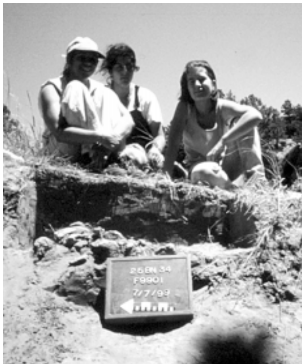
Excavated Native American fireplace, Banner County, 1999.

The Nebraska State Historical Society recognizes the need to balance preservation and the public's desire to participate in research. This publication series is directed to this need. The Society sponsors volunteer excavations for the general public.