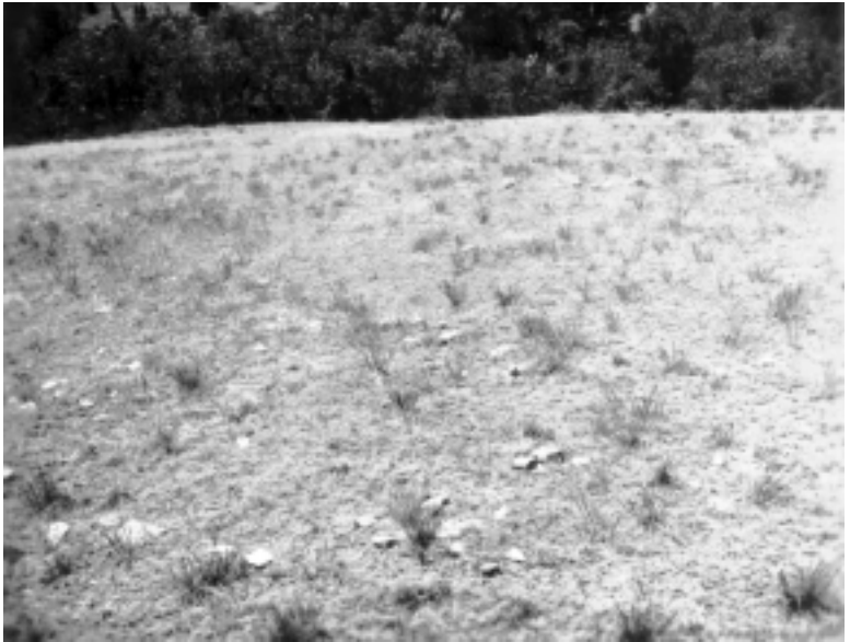
Tipi ring in Sioux County, 1966.

produced fairly quickly with little effort and is associated with light-duty butchering or plant processing. The majority of tools recovered are in the early stages of manufacture. Many may have been the product of stone core reduction. Raw material in this form is easier to transport than blocky cores and allows the carrier to manufacture tools later at locations distant from the quarry.