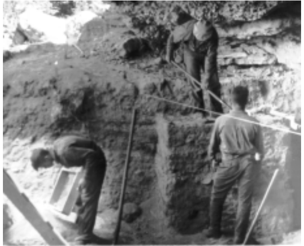
Ash Hollow Cave, Garden County, 1939.

During the late prehistoric period (A.D. 1000–1700) Central Plains tradition people in eastern and central Nebraska were actively engaged in hunting and gathering of wild plants and animals, as well as horticulture. The presence of Central Plains tradition people in the Panhandle region is evident in the form of small, side-notched, or triangular projectile points and ceramic sherds recovered from a variety of locations including butte tops, rock shelters, and stream valley terraces. However, very few sites of this age have been systematically investigated in the Panhandle, and only one semi-permanent habitation site of this age has been documented in the region.