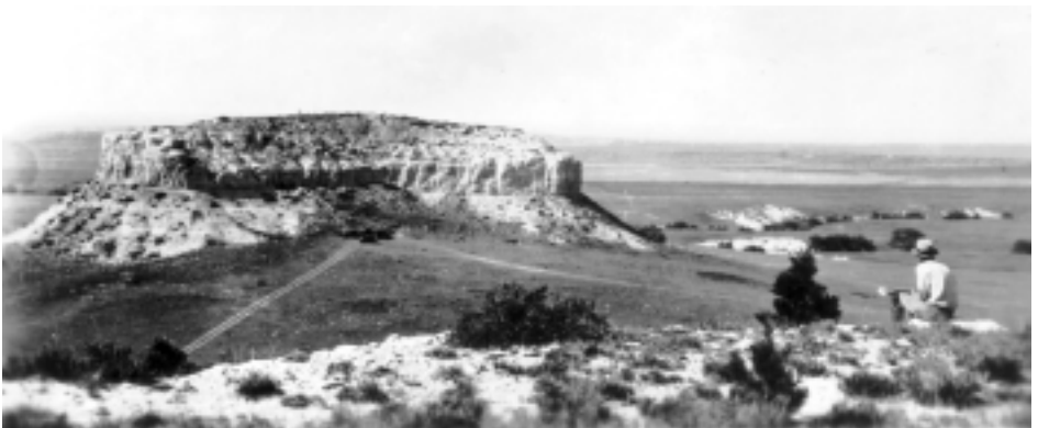
Signal Butte, Scotts Bluff County, 1930s.

The Plains Archaic or Archaic period (9,000–2,000 years ago) is characterized by nomadic, broad-spectrum hunting and gathering and is well represented in western Nebraska. Many private collections from the region include tapered spear points and stemmed or notched projectile points dating to this period. Warmer and drier climatic conditions on the Plains during this period affected plant communities and forage availability for large grazing mammals