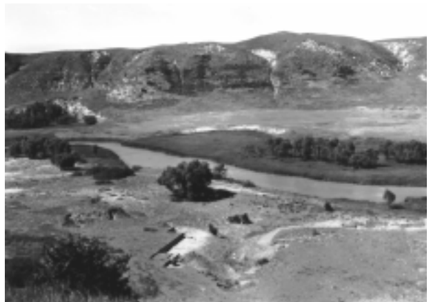
Archeological excavation on the Middle Loup River, late 1940s.

early 1700s. Dismal River people had a subsistence economy based primarily on hunting and secondarily on horticulture. Bison were the chief animals hunted, although deer, beaver, birds, turtles and freshwater mussels were also eaten. Evidence for horticulture is present, but limited. Bison scapula digging tools have been recovered from several sites. Charred remains of corn and squash or gourd provide direct evidence of domesticated plant use. Wild plant foods were also eaten. Remains of plums, chokecherries, hackberries, and black walnuts have been recovered. Chipped stone and bone tool technology included projectile points, scrapers, knives and drills, bison scapula hoes, fleshers, and bone awls. Restorable ceramic vessels indicate globular to somewhat elongate shapes with constricted necks. Individual sherds and reconstructed portions suggest other forms, including bowls with constricted necks or "seed bowls," vessels with flat shoulders and recurved rims, vessels with flat bottoms, and miniatures. Dismal River pottery is characteristically grey-black in color with a smooth or simple stamped surface and tempered with gritty paste, fine to medium sand or mica. Decoration is scarce and usually confined to the lips, consisting of