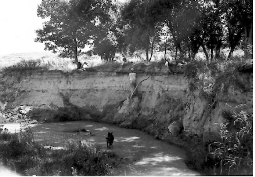
Investigating buried artifacts in the Loup River bank, 1940s.