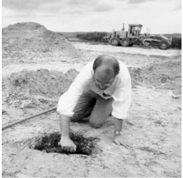
Excavation of ancient hearth near Theford.

At this point, Late Archaic, Woodland, protohistoric, and cattle ranching sites seem to be the most abundant. Spikebox Ranch offers an uncommon opportunity to gather large scale archaeological data within an environmentally diverse interior Sand Hills tract.