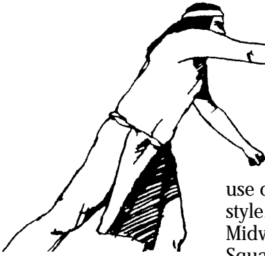
Spear thrower or "atlatl."

becoming more familiar with local resources. Few sites of this age have been excavated in Nebraska and only one in the Sand Hills.