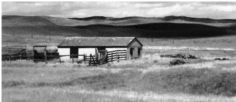
Abandoned shed and corral on Spikebox Ranch.

reconnaissance along several lakes and portions of the North Loup River at the Spikebox Ranch in southwestern Cherry County. Thirty-eight archeological sites were identified and documented as the result of an initial inspection of approximately 1,100 acres. Excluding Paleoindian components, a nearly complete cross-section of Central Plains time periods is represented.