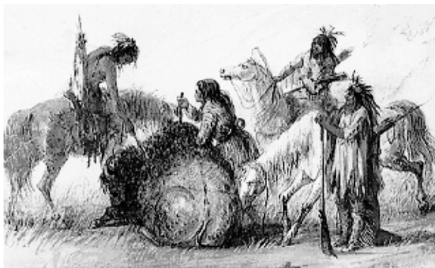
“Taking the Hump Rib” by Alfred Jacob Miller

punctates and incised or impressed lines. A common shelter was a round lodge, about twenty-five feet across, covered by grass or brush over a five-post foundation with leaners built either on the surface or in a shallow excavation.