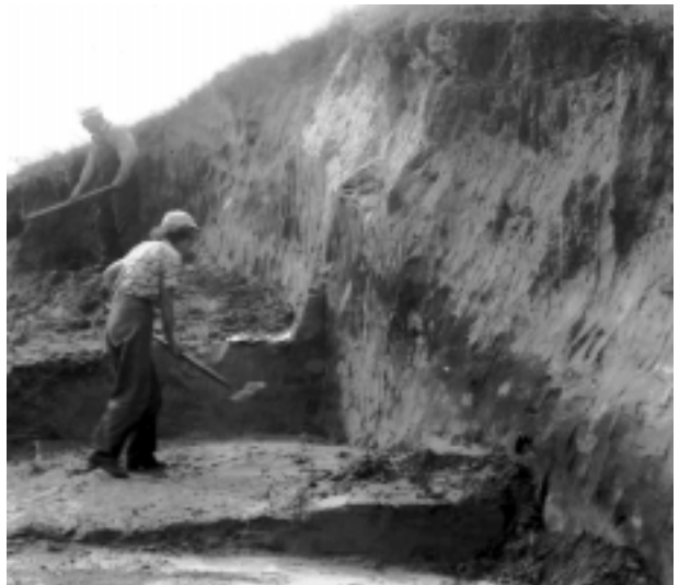
Excavation of the Kelso Site, 1947.