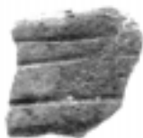
Pawnee pottery fragments from the 1700s.