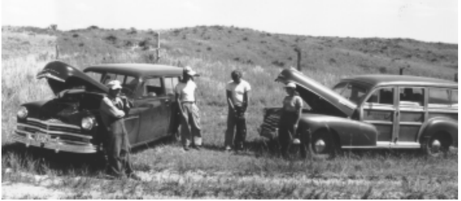
Archeological crew exploring the Sand Hills in the late 1940s.

It is difficult of penetration, as the roads, that is to say the trails are few and in places, deep in loose sand that renders progress slow and uncertain. The population is sparse, a ranch here and there, far apart and hidden among grassy hills; few people know this region well enough to give directions that are clear and easy to follow. Nothing looks more like a small swampy lake surrounded by round topped sandy hills, than another such water hole at the bottom of a depression between similar hills and dunes. Cutting across country, over the prairie and the shoulders of connected hills, is rough going, with a fair chance of getting at least temporarily lost, or of breaking springs or car axles. Decidedly it is a country for horse-back riding, which is a mode of locomotion entirely too slow for the rapid survey of scattered sites. The intensive heat of June in Nebraska was still augmented by the sandy country and the laborious walking around blowouts. For these reasons we hardly did more than attempt short reconnaissance trips in three separate districts in order to secure a first acquaintance in a region that deserved more extensive exploration.