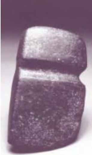
Plains Woodland tradition axe.

early 1700s. Dismal River people had a subsistence economy based primarily on hunting and secondarily on horticulture. Bison were the chief animals hunted, although deer, beaver, birds, turtles and freshwater mussels were also eaten. Evidence for horticulture is present, but limited. Bison scapula digging tools have been recovered from several sites. Charred remains of corn and squash or gourd provide direct evidence of domesticated plant use. Wild plant foods were also eaten. Remains of plums, chokecherries, hackberries, and black walnuts have been recovered. Chipped stone and bone tool technology included projectile points, scrapers, knives and drills, bison scapula hoes, fleshers, and bone awls. Restorable ceramic vessels indicate globular to somewhat elongate shapes with constricted necks. Individual sherds and reconstructed portions suggest other forms, including bowls with constricted necks or "seed bowls," vessels with flat shoulders and recurved rims, vessels with flat bottoms, and miniatures. Dismal River pottery is characteristically grey-black in color with a smooth or simple stamped surface and tempered with gritty paste, fine to medium sand or mica. Decoration is scarce and usually confined to the lips, consisting of