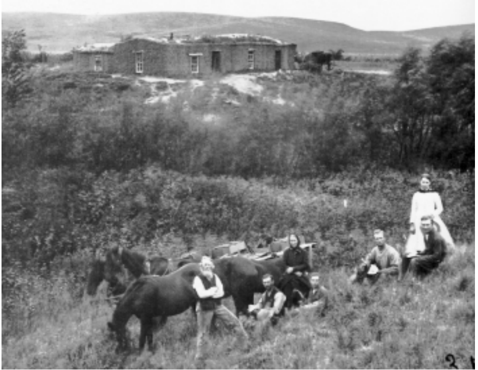
Custer County homestead, 1880s.

Increasing military presence began following the Ft. Laramie Treaty of 1868 to protect Native American lands from encroachment by settlers. Detachments from Forts Robinson, Niobrara, and Hartsuff became familiar with the region during attempts to supply the Pine Ridge and Rosebud Sioux and keep peace between the Indians and Euroamericans.