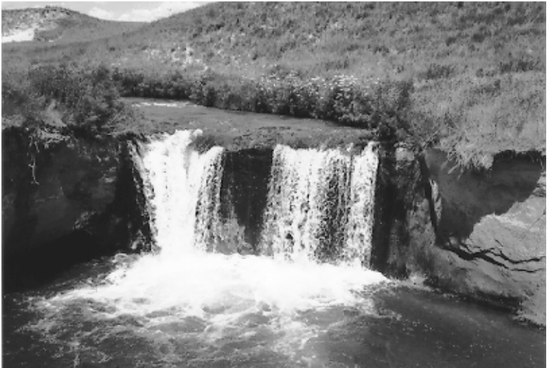
Waterfall on Spikebox Ranch.

Recent systematic survey efforts by the Historical Society have included a cultural resources